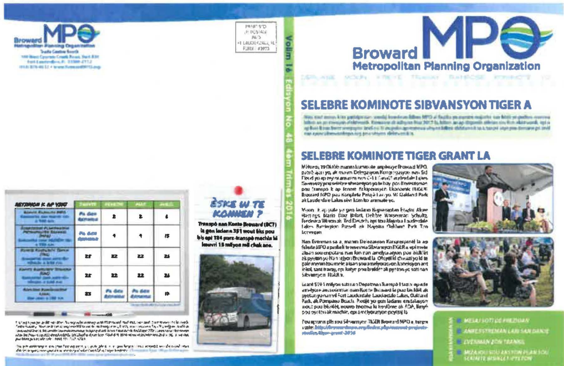
Note: Figure shown represents the front and back pages of the newsletter for illustration purposes only.