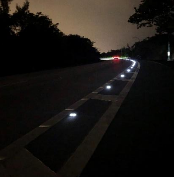
Miami Dade County green, buffered and LED delineated bike lane