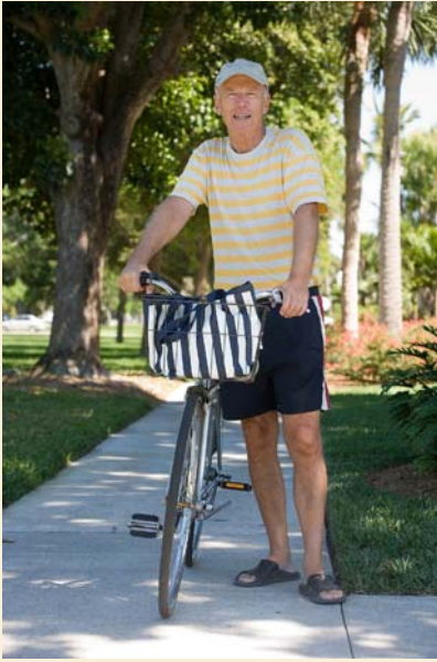
All Broward County Greenway projects were included.