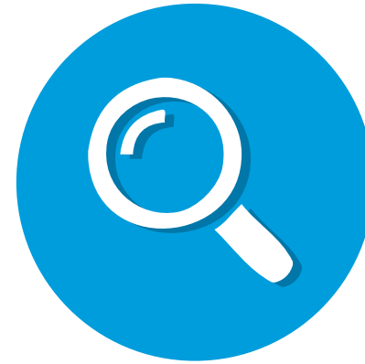
Scope of Work