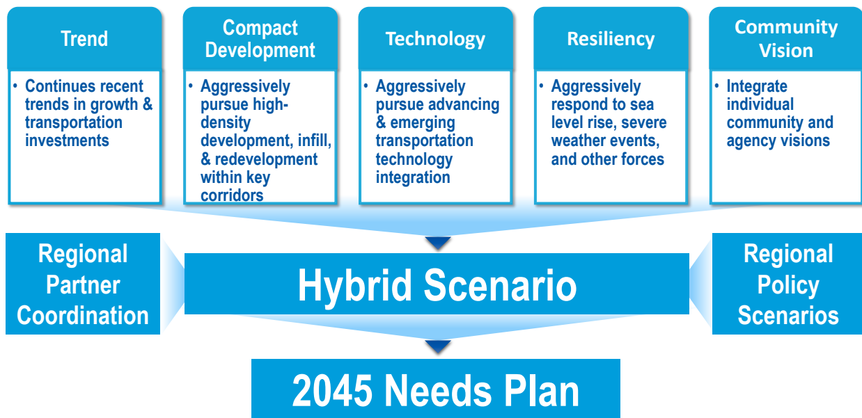
Figure 1: Extreme Scenarios and Outcomes

The proposed scenarios and anticipated outcomes are shown in Figure 1. The figure also reflects input resulting from regional partner coordination and regional policy scenarios considered as part of the 2045 RTP.