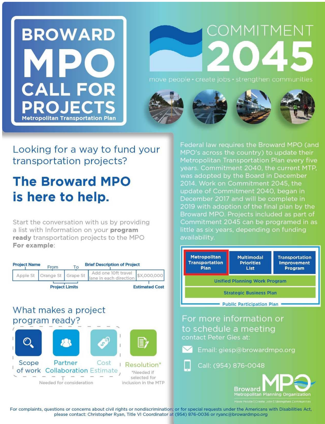
Figure 2: Commitment 2045 Call for Projects