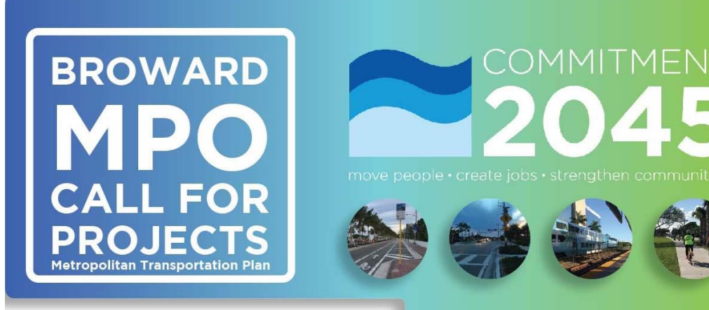
Figure 2: Commitment 2045 Call for Projects

Looking for a way to fund your transportation projects?