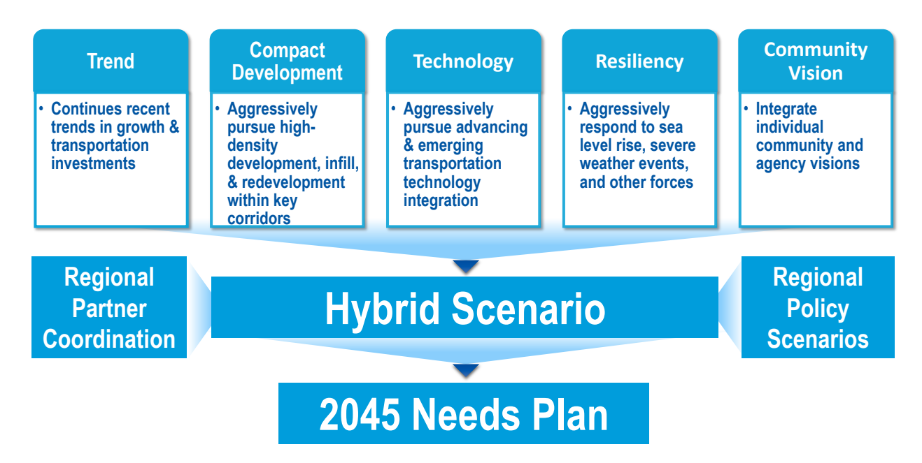
Figure 1: Extreme Scenarios and Outcomes

The proposed scenarios and anticipated outcomes are shown in Figure 1. The figure also reflects input resulting from regional partner coordination and regional policy scenarios considered as part of the 2045 RTP.