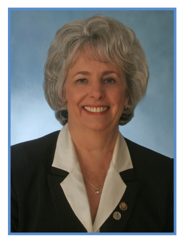
Mayor Rae Carole Armstrong Chair, Broward MPO Mayor, City of Plantation