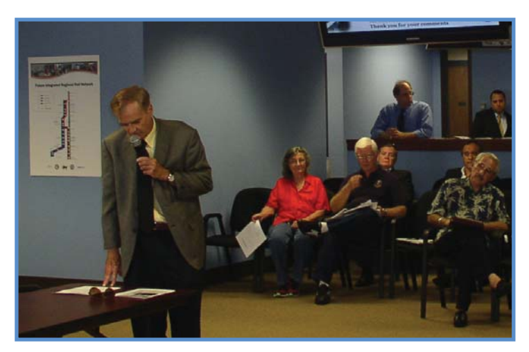
Several members of the public participated when given the opportunity to address the federal review team during the public meeting.