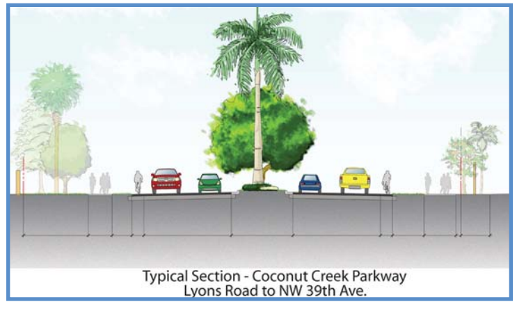
The rendering above depicts a typical section of how the finished corridor will look.

The educational facilities along the Educational Corridor have an estimated population of over 20,000 full & part-time students and a residential population of 18,000 within a <sup>1</sup>/<sub>4</sub> to <sup>1</sup>/<sub>2</sub> mile. This phase of the project will connect educational facilities such as Atlantic Technical Center, Coconut Creek High School, Broward College, and the Broward County Library. On completion of the improvements proposed to the Education Corridor, educational facilities would be accessible to one another by bus, shuttle, bicycle and foot. This redevelopment of the Coconut Creek Parkway provides a unique opportunity to benefit several municipalities, as