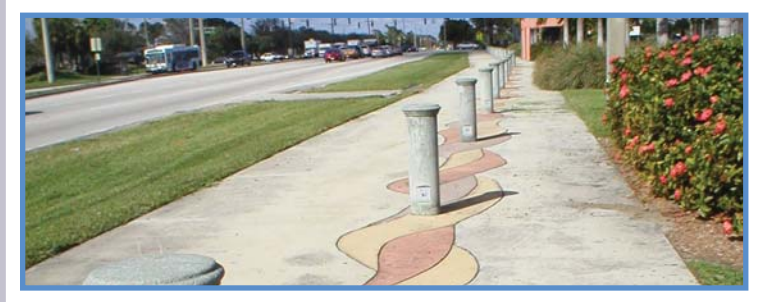
The Coconut Creek Parkway is the recipient of multiple grants to make positive changes for travel throughout the corridor, including sidewalk beautification.

Home to several educational campuses, the two-mile long Coconut Creek Parkway is a four-lane road with an open median that has been the subject of safety concerns. The City and its partners have developed a master plan for this stretch of roadway that will transform it into a pedestrianfriendly linear park. This includes pedestrian sidewalks with lighting for safety and beautification, and the construction of a neighborhood transit center.