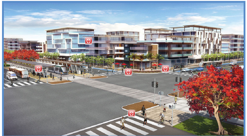
An interactive version of this graphic showing a Gateway Hub can be found at www.browardmpo.org . The 2035 Long Range Transportation Plan identifies two Gateway Hubs, three Anchor Hubs and one Community Hub for future implementation in this Study area.

The Study Area is approximately 27 square miles and covers the cities of Plantation and Sunrise. The boundaries are the