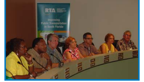
ntatives from Broward's CIR, Miami-Dade's CTAC, and Palm Beach's CAC served as the board of panelists for the 2008 meeting.