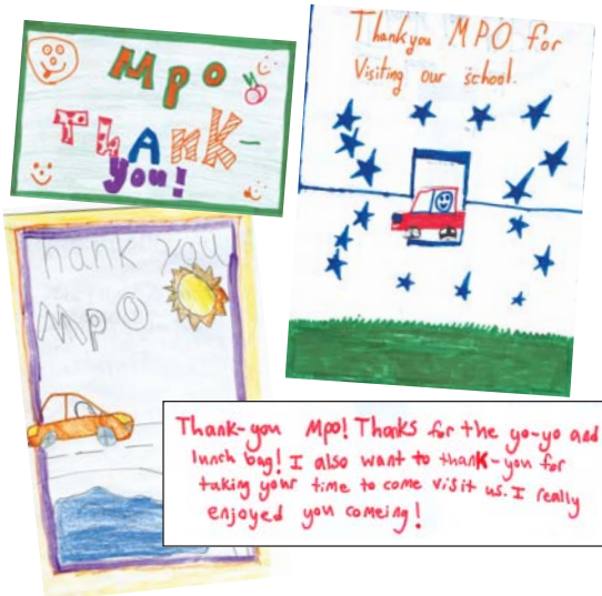
Thank you cards from Winston Park Elementary.