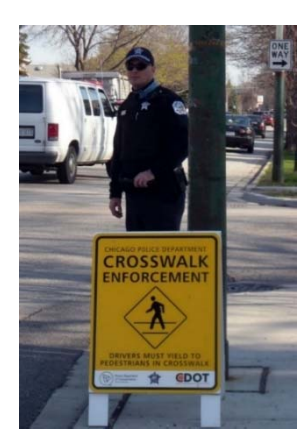
CDOT – Crosswalk Enforcement Initiative

Chicago Department of Transportation (CDOT) was successful in a recent crosswalk enforcement campaign in which police officers strategically staged themselves at highly utilized crosswalks and verified that motorized vehicles were not encroaching upon the crosswalk. Drivers that were caught encroaching crosswalk were first given a warning and also educational materials explaining the law and why it was important to respect pedestrians. Drivers that were habitually encroaching crosswalks received a citation.