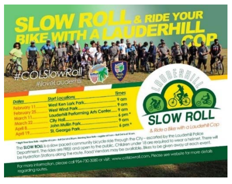
Lauderhill – Slow Roll flyer

The Slow Roll ride is an episodic event that invites the local community to enjoy a safe group ride along with the Lauderhill Police Department. The ride is not only a chance to ride along