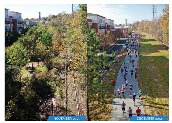
Atlanta Beltline before and after

include the Atlanta BeltLine, Chicago 606, Underline and the High Line. All projects took many years to coordinate and plan, however throughout the process, the public was learning more about their community, learning more about bicycling laws, learning more about innovative events and encouragement programs, learning more about their existing and planned nonmotorized network, and more.