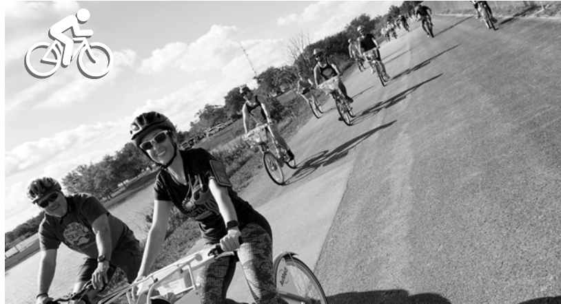
The 2018 Let's Go Biking! was the largest event yet, with over 80 adults participating in an adult bike ride from Vista View Park to Oak Hill Park and over 30 children participating in a group bike ride around the Vista View Park in the Town of Davie. This year's event featured a bike rodeo, helmet fitting, a bounce house, a bike raffle and other bicycle related goodies and giveaways.